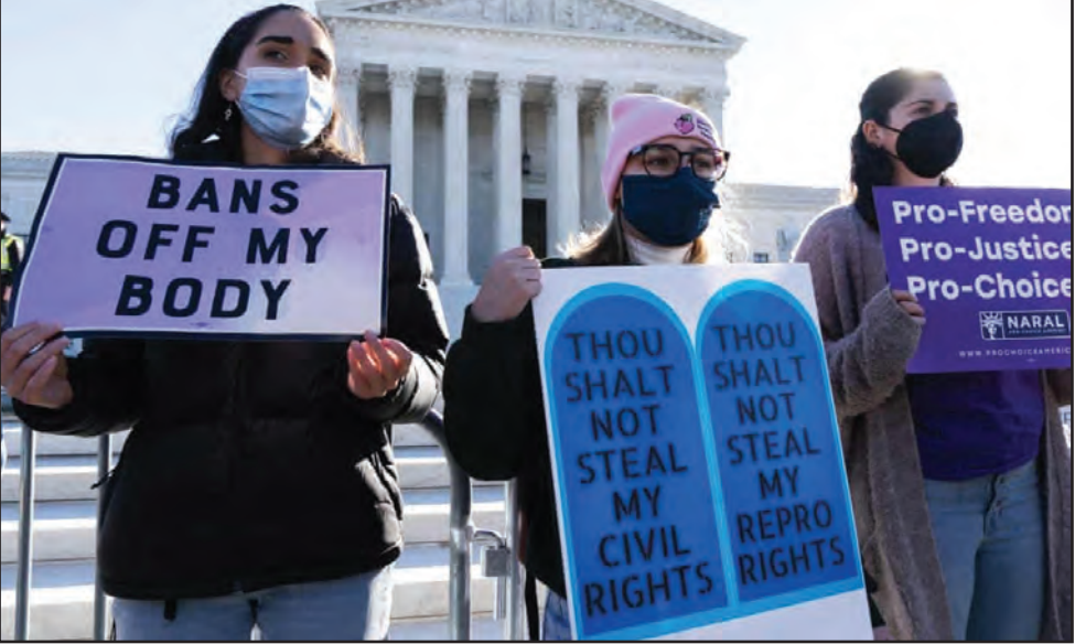
S.B. 1 is currently stayed from going into effect after the Indiana Supreme Court blocked its implementation until it hears arguments on its constitutionality early in 2023.