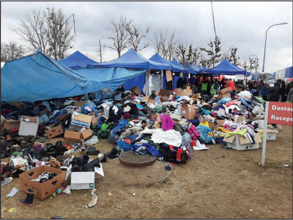
Boxes of food, clothing and supplies await thousands of Ukrainian refugees at a humanitarian checkpoint just off the Polish side of the Ukrainian-Polish border.

Phil Goss '90 discusses his personal experiences aiding Ukrainian refugees as they flee west across the Polish-Ukrainian border SEE PAGE 3