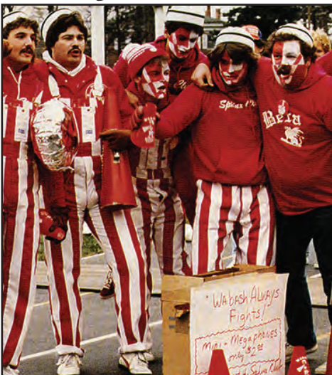
Front page of Caveman's special Homecoming issue, 1927.