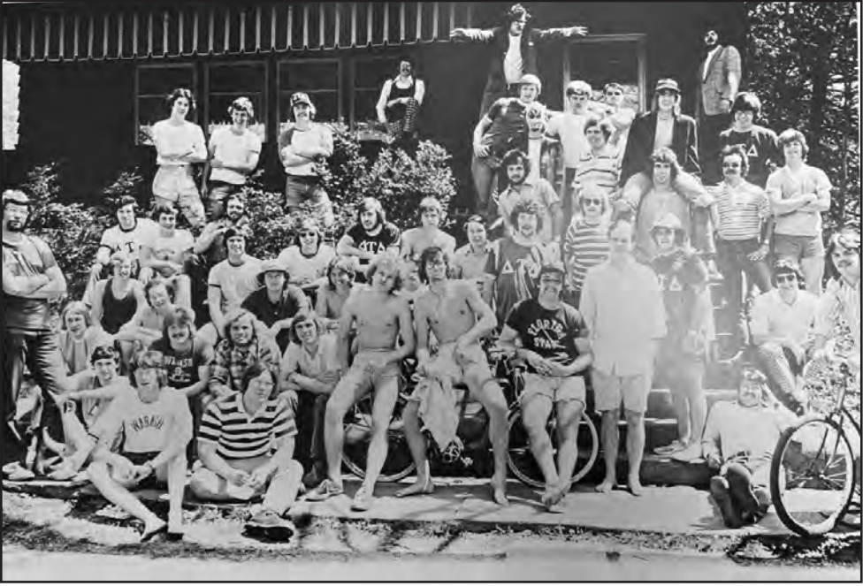
The Delta Tau Delta Class of 1967 poses for a house photo 55 years ago on the 95th anniversary of the chapter.