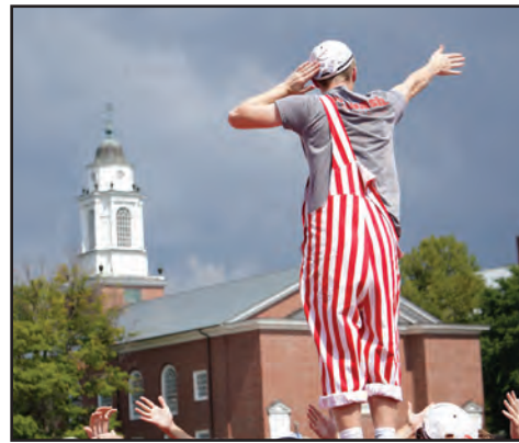
Members of the Sphinx Club cheer on the team against North Central on Saturday, September 10, at Little Giant Stadium.